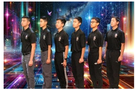
TROY HIGH SCHOOL W.A.T.T.