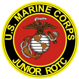
MARINE CORPS JROTC