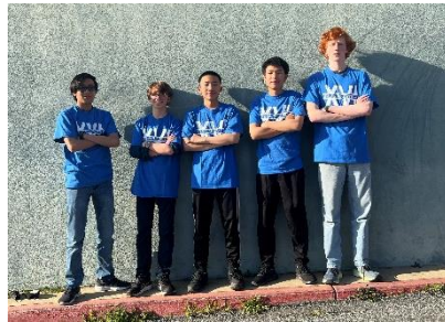
LOWELL HIGH SCHOOL CyberCardinals