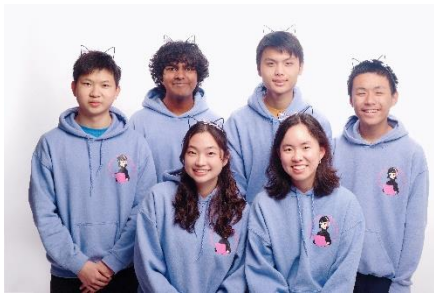
CANYON CREST ACADEMY Conspiracy