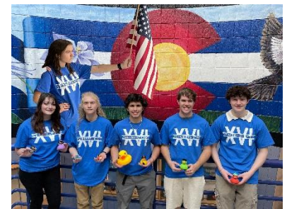
HIGHLANDS RANCH HIGH SCHOOL Falcon Transfer Protocol