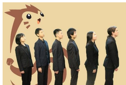
TROY HIGH SCHOOL Runtime Terror