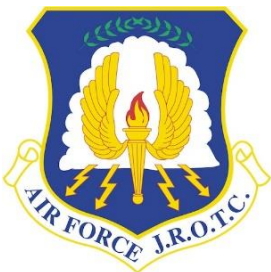
AIR FORCE JROTC