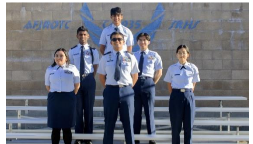
SCRIPPS RANCH HIGH SCHOOL Terabyte Falcons