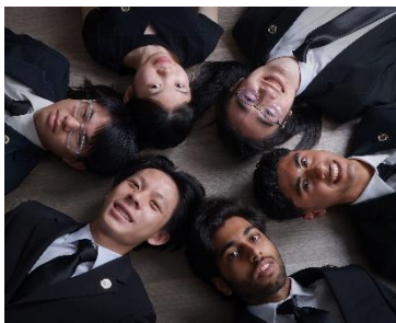
DEL NORTE HIGH SCHOOL CyberAegis Triton