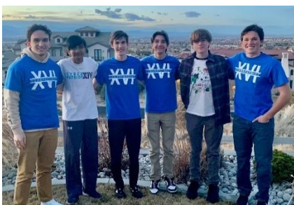
ROCK CANYON HIGH SCHOOL Killer Queen