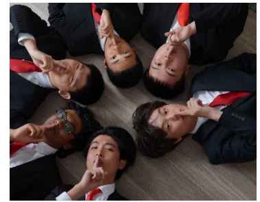
DEL NORTE HIGH SCHOOL CyberAegis Aegir