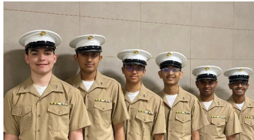
ALLEN HIGH SCHOOL Bravo Eagles