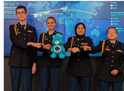
THEODORE ROOSEVELT HIGH SCHOOL TX Patriot | Carebears' Revenge