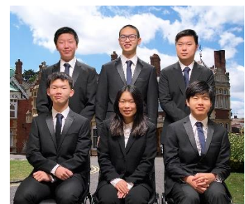
WESTVIEW HIGH SCHOOL TitanTurtles