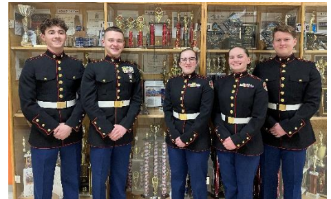
MOUNTAIN VIEW HIGH SCHOOL Wildcat Battalion Scarlet Team