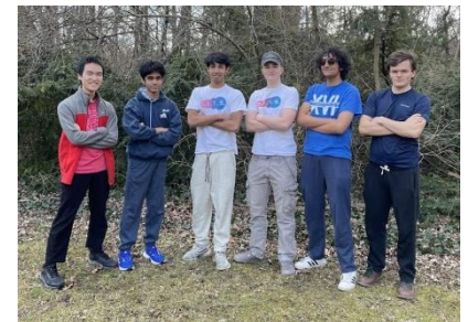
PLYMOUTH-CANTON COMMUNITY SCHOOLS View Source