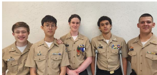
MIAMI BEACH SENIOR HIGH Super Moggers