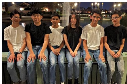
FRANKLIN HIGH SCHOOL Half Dome