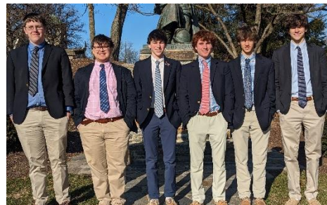
LOYOLA BLAKEFIELD Charlie's Angels