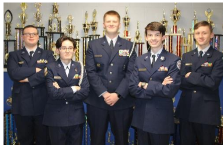
KNOB NOSTER HIGH SCHOOL Komputer Kernels