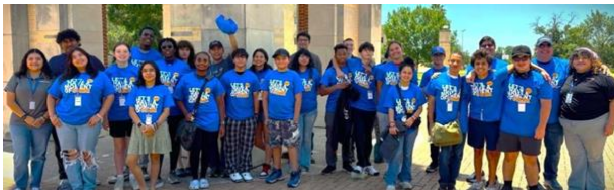
Co-ed Advanced Camp, St. Mary's University, San Antonio, Texas

Another camper, who attended all four camps, said she "would tell someone who is thinking about going to camp next year, that it is really fun when you stop thinking about what you don't know and start thinking about how you're going to improve your skill!"