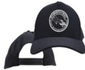
CyberPatriot Logo Hat $33.00