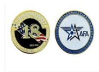
CyberPatriot 18 Challenge Coin $10.50

CyberPatriot 18 challenge coins and other CyberPatriot branded items are available on ShopAFA. Visit ShopAFA today and to get your CyberPatriot items.