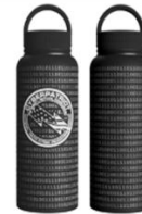
CyberPatriot Insulated 32 oz Bottle $36.00