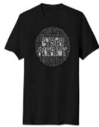
CyberPatriot T-Shirt $35.00