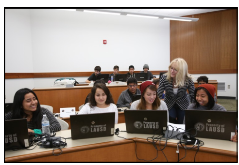
Competitors work hard to complete the CyberDay LA images before the three-hour deadline.

With the successful completion of this huge event, plans are already being discussed for next year. With a smooth technical rollout, seamless team registration, powerful hosting, solid venue support, and a lot of happy competitors and sponsors on hand, CyberDay LA