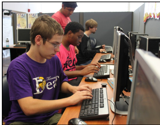
The Virtual Vikings from the Tennessee School for the Deaf are already hard at work training for CyberPatriot VI.