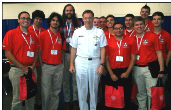
Students from the winning team of the Virginia Governor's Cup, Marshall Academy, were recognized at a recent event hosted by the Armed Forces Communications and Electronics Association (AFCEA). During the event the team visited multiple industry exhibits and had lunch with a few key JAG legal experts. They also met the director of the NSA, Adm. Mike Rogers (pictured above).

AFCEA is a 501(c)(6) non-profit dedicated to increasing knowledge through the exploration of issues relevant to its members in information technology, communications, and electronics for the defense, homeland security, and intelligence communities.