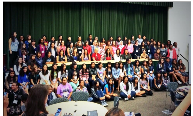
A group shot of the CyberGirlz Summit