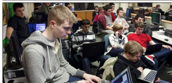
Students at Marshall Academy prepare for the competition.