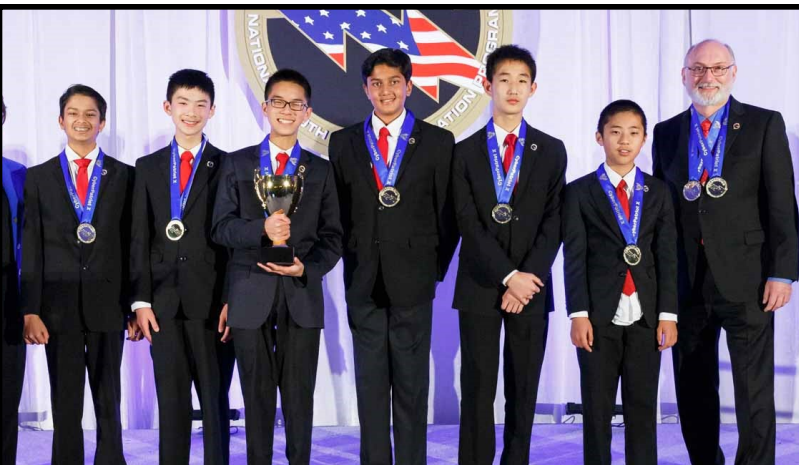
MIDDLE SCHOOL DIVISION